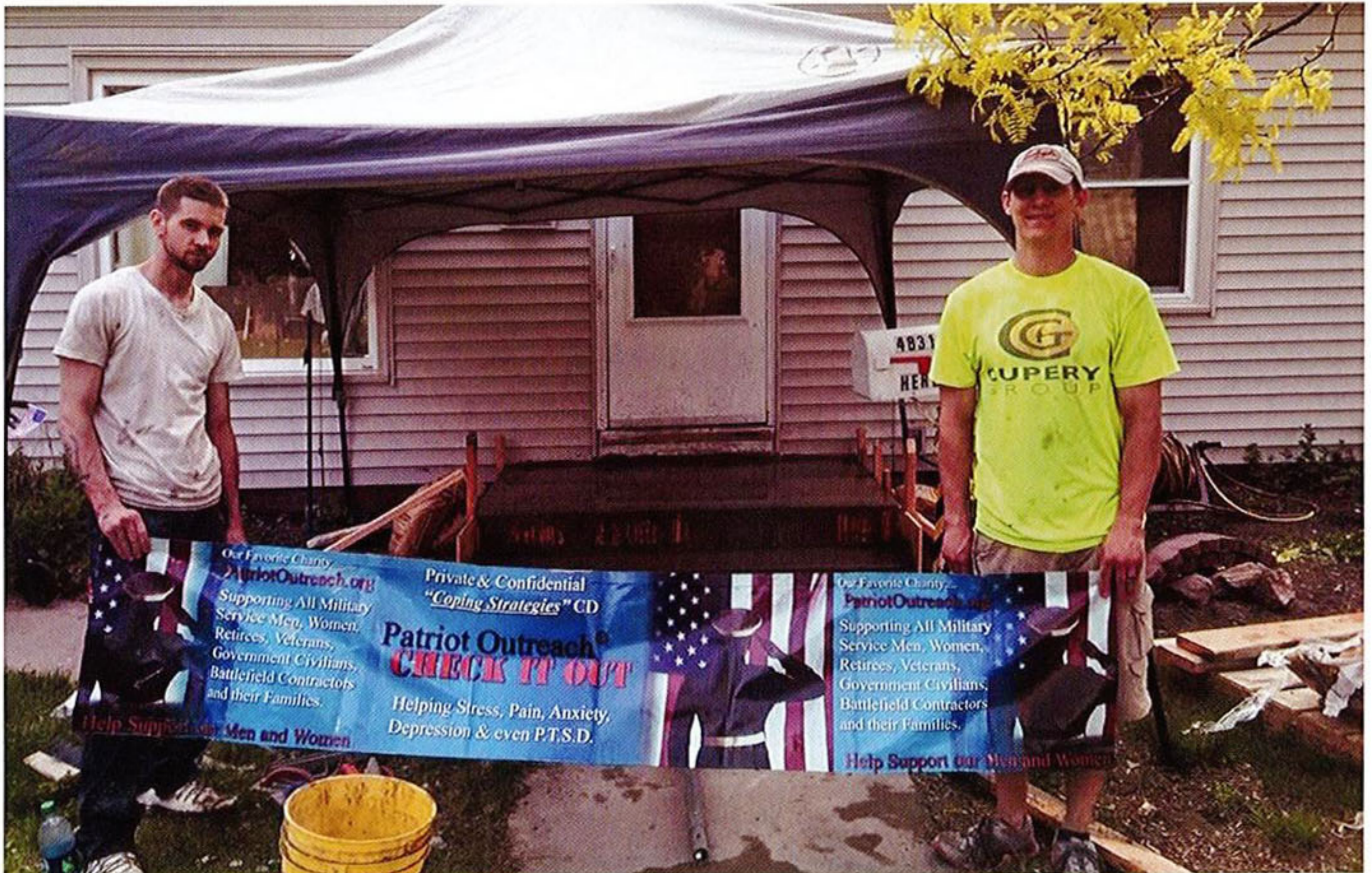
Patriot Outreach does just that, reaches out to those struggling.