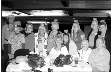
Second group wearing mustaches, "We still haven't reached our goal and that is why we are traveling incognito!"